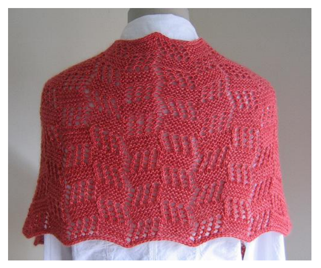
Susan's Topsy Turvy – 3 repeats