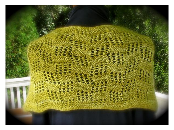
Sally's Topsy Turvy – 2 <sup>1</sup>/<sub>2</sub> repeats

Alternative Bind Off: bind off normally following "k8, p8" sequence as established.